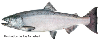
Illustration by Joe Tomelleri

Salmon in this brochure refer to anadromous (ocean run) Chinook Salmon of the species Oncorhynchus tshawytscha .